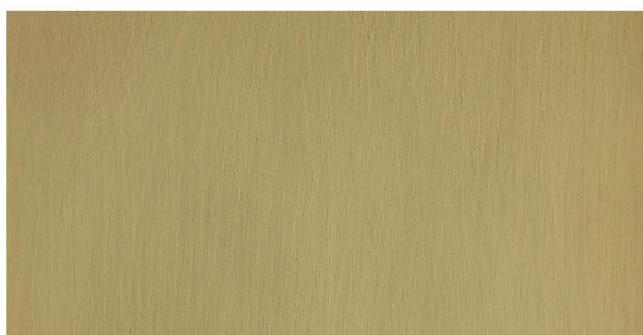
BRASS brass galvanized steel