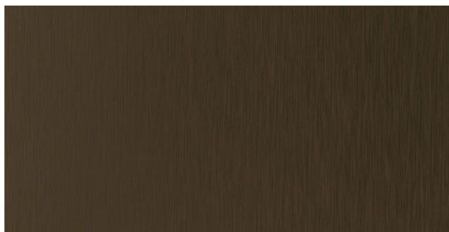
BRONZE bronze galvanized steel